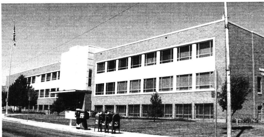
Bannock County Courthouse, Pocatello, Idaho