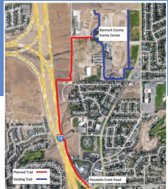
Aerial view of the trail route

The Idaho Transportation Department (ITD) has committed to constructing a bicycle/pedestrian trail in 2024 as part of their project to reconstruct the Wye Interchange between I-15 and I-86.