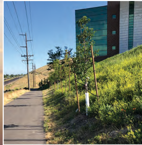
Farm Bureau trail