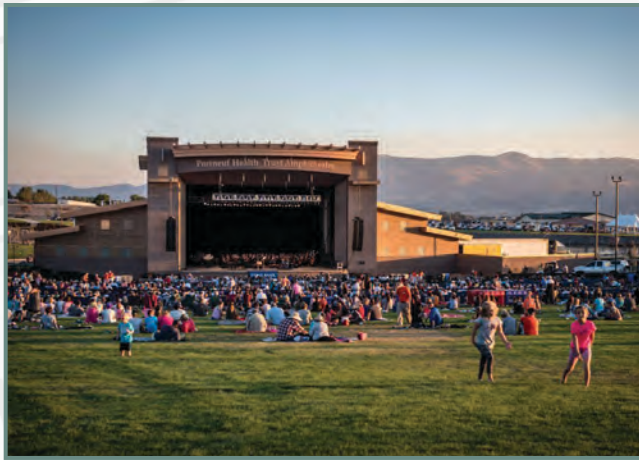
Portneuf Health Trust Amphitheatre