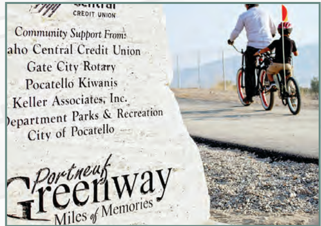
Recreating on the Portneuf Greenway trail system