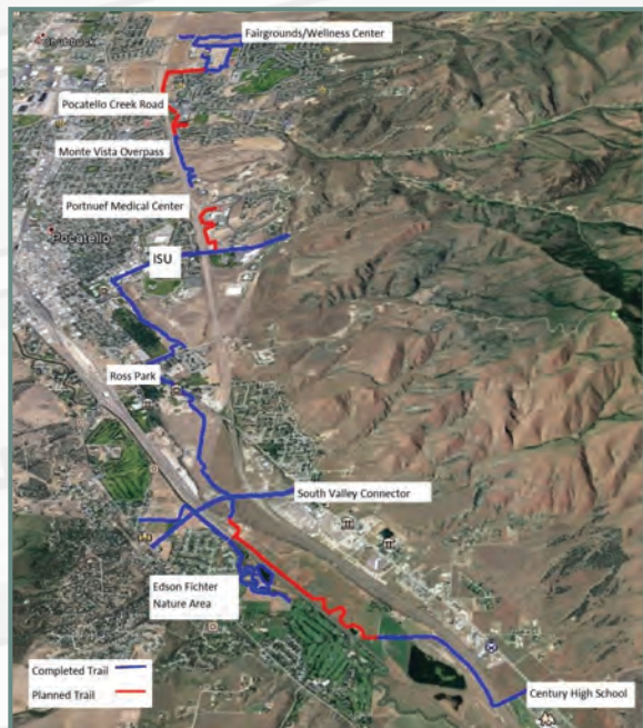
Aerial view of the I-15 corridor

The new asphalt trail will extend from the intersection of Pocatello Creek Road and I-15 north and continue along I-15. The trail will turn east and be routed across the Bannock County Events Center to an existing trail that connects with the Portneuf Wellness Complex.