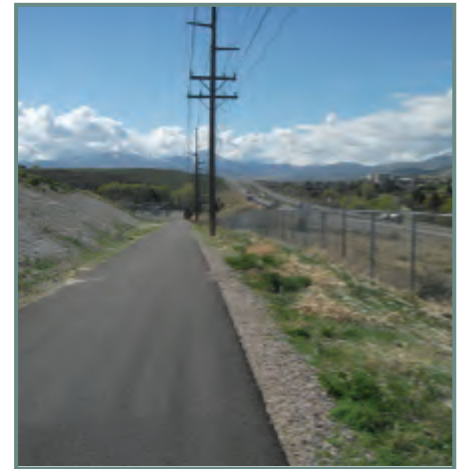
Marshal Racine Trail and its separation from I-15

This trail will improve safety by providing an off-street link for pedestrians and cyclists between Pocatello and Chubbuck. There are no existing off-street routes from the Highlands neighborhood to the rest of Pocatello and the on-street routes have heavy traffic and are steep. Chubbuck is expanding its system of trails west of I-15 and this trail will be an important link with those trails and new trails in the Northgate area.