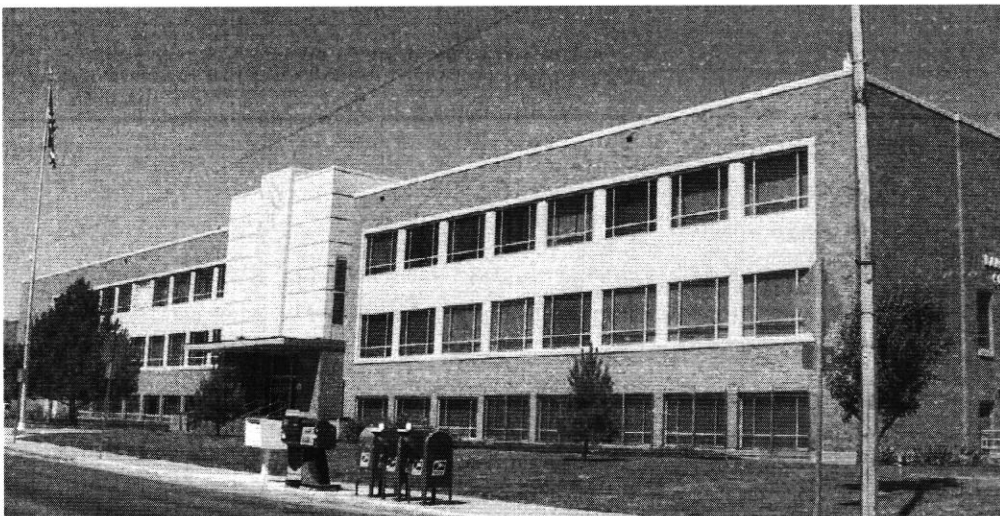
Bannock County Courthouse, Pocatello, Idaho